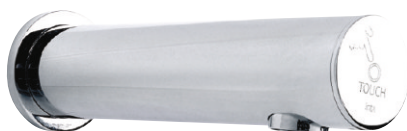
Perfect Time - Wall Mounted