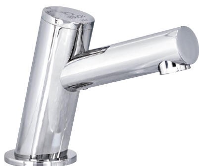
Perfect Time - Deck Mounted

With an 8 second factory preset, installation or maintenance staff can easily change this time manually according to the needs. Running time adjustment is not accessible to the end users.