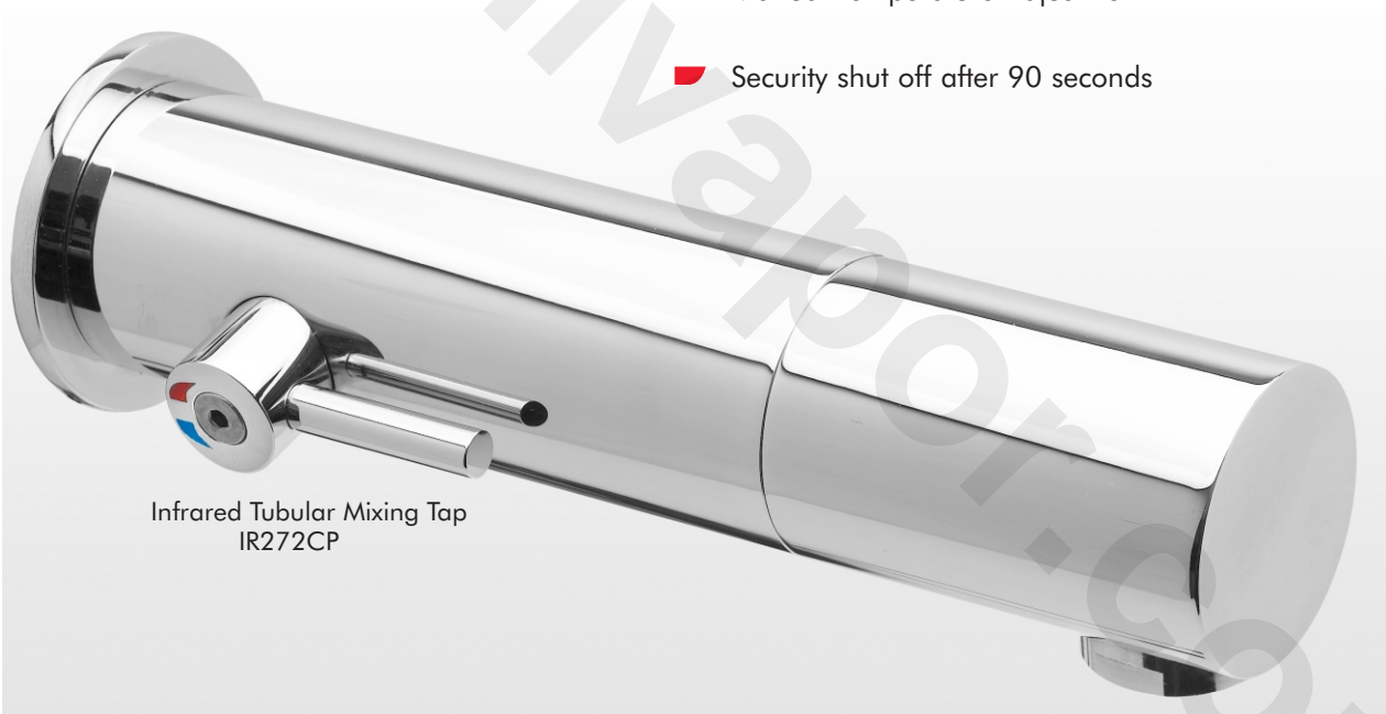
Infrared Tubular Mixing Tap IR272CP