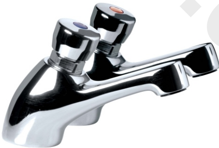
non concussive basin mounted tap (pairs) NC160CP

inta taps used as water economy device operate for a period of time and then closes automatically