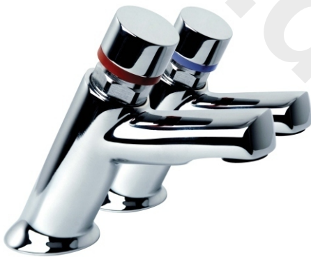
non concussive basin mounted tap (pairs) NC162CP

Available in standard and contemporary styles the push tap is safe, reliable and reflects the quality of the range of total washroom solutions.