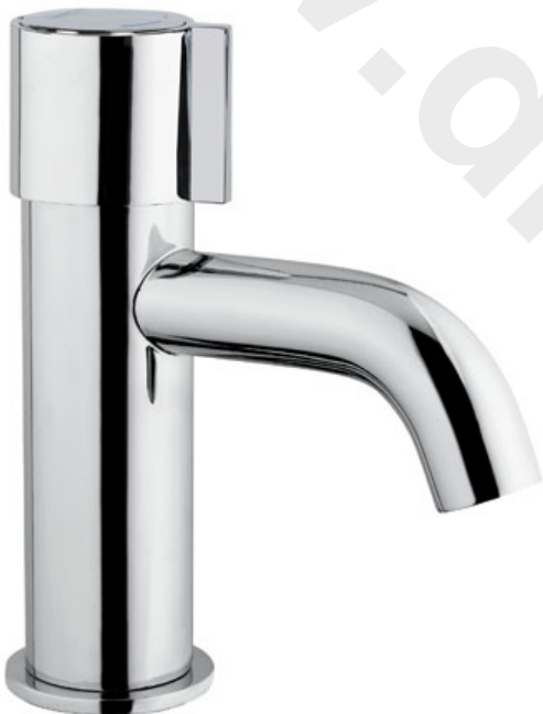
non concussive basin mounted manual mixer tap NC230CP

The Non Concussive basin mounted tap with Adjustable Temperature control is designed for use with the Inta range of Thermostatic Mixing Valves. The tap is operated by manually pressing the control knob, the non concussive action automatically closes the tap after approximately 15 seconds. Rotating the control knob clockwise or anti-clockwise reduces or increases the mixed water temperature.