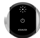
Shower warming up

To switch on your shower, press the button on the remote control. The white LED light will light up and start to flash. It will continue to flash until the water has reached temperature. Once the water has reached temperature, the white LED light will stop flashing and remain on for a further 5 seconds. Sudden temperature change or disruption of signal can affect this function and LED status.