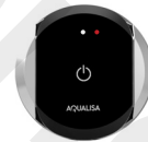
Out of range

Your remote will display white and red LED lights to indicate a weak signal, when the button is pressed.