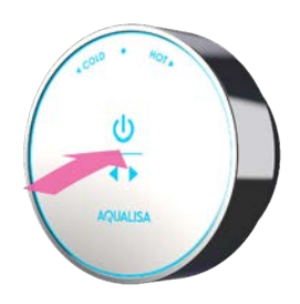
CHANGE OUTLET Push and hold for over 3 seconds and release when flow switches between outlets.