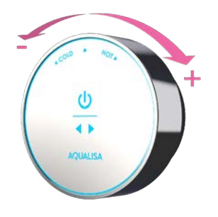
TEMPERATURE Adjust during shower