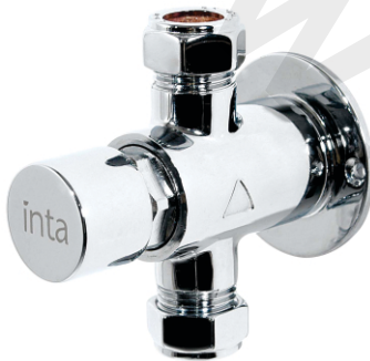
Time Flow Shower Exposed TF997CP

Water conservation is essential and in some public establishments where multiple water outlets are used, the Inta range of Time Flow Control systems are an eco-friendly, stylish and economical solution to the problem of water wastage. All of the Inta Time Flow Controls are designed to work with the Intamix range of the Thermostatic Mixing Valves