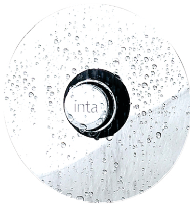
Time Flow Shower Concealed TF997CP